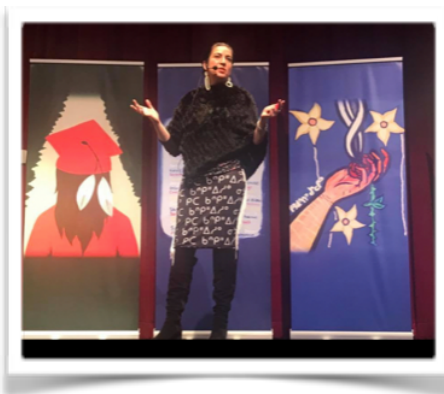
Tanya Talaga on October 23, 2018 in Vancouver for the Massey Lecture Series titled, “All Our Relations: Finding the Path Forward.”

NVSD began its first ever Indigenous Book Club, featuring Tanya Talaga's bestselling book, Seven Fallen Feathers: Racism, Death and Hard Truths in a Northern City . Talaga investigates the deaths of seven Indigenous teenagers in Thunder Bay and the systemic effects of colonization and racism that led to the loss of these youth. Tanya Talaga was also recently in Vancouver sharing her story as part of the Massey Lecture Series titled, “All Our Relations: Finding the Path Forward.” If you did not get a chance to see Tanya Talaga live as part of the Massey Lecture Series you can listen online here